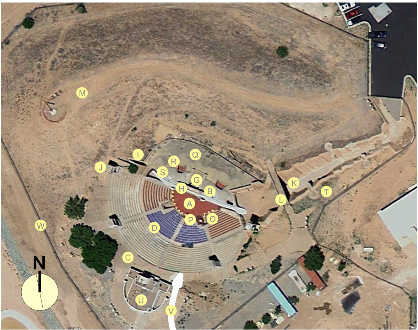
FIGURE 1. AERIAL PHOTOGRAPH KEYED.